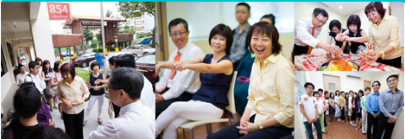
Guest-of-honour: Minister of State for Health and Manpower Dr Amy Khor, joined by Member of Parliament for Nee Soon GRC, Er. Dr. Lee Bee Wah

Open House of Clarity Singapore 6 Feb 2013 in collaboration with Wellness for Life! @ Nee Soon South