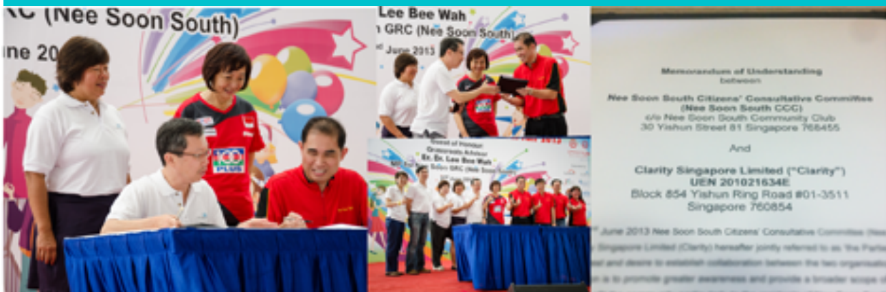
Official Signing of Memorandum of Understanding between Nee Soon South Citizens' Consultive Committee and Clarity Singapore Limited

Official Signing of Memorandum of Understanding 2 Jun 2013